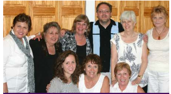
Tribunal organizers include the Feminist Task Force, the Loretto Community at the United Nations, Eco-Justice Collaborative, Citizens Against Ruining the Environment (CARE) and Pilsen Environmental Rights Organization (PERRO).

The Spring 2012 US Women and Climate Justice Tribunals are not the first of their kind to create a platform for grassroots women to share the impacts of climate issues. On the contrary, these US Tribunals have been preceded by 15 Gender and Climate Justice Tribunals in the global south within the past three